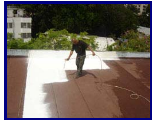
Permakote on Modified Roofing